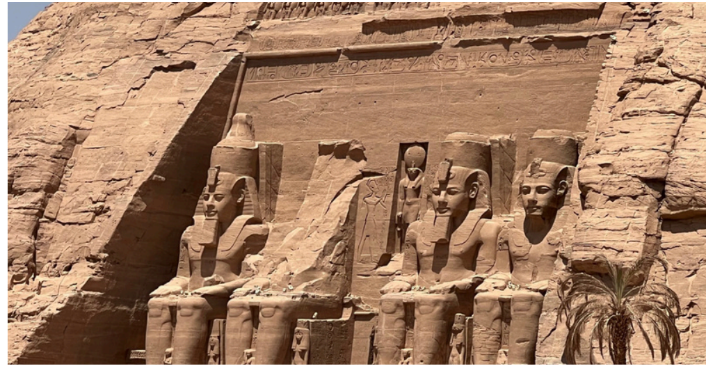
Ramses II temple