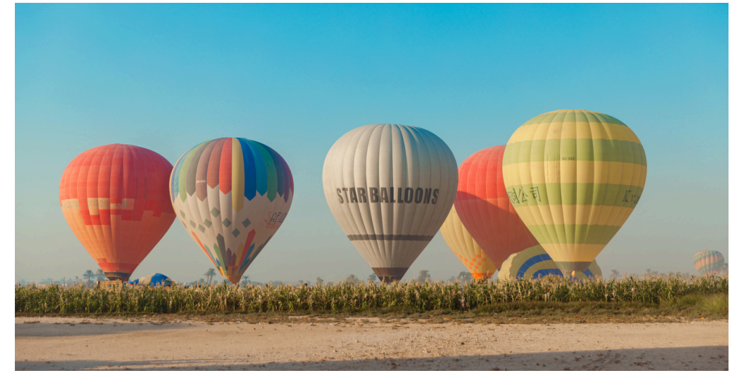
Hot Air Balloon