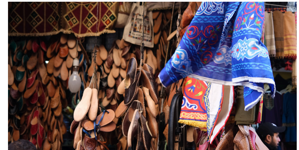
Souk Khan Al Khalili