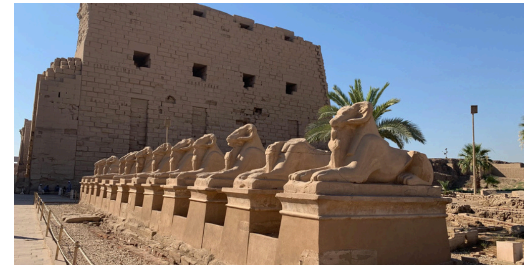
All the major temples by the Nile