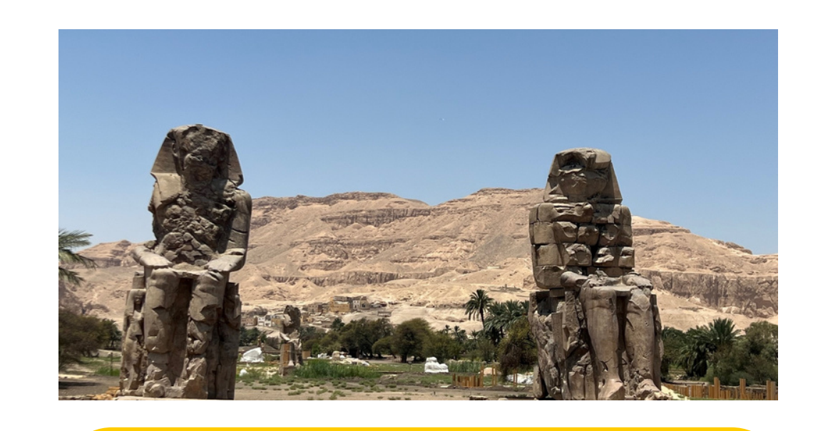
Valley of the Kings