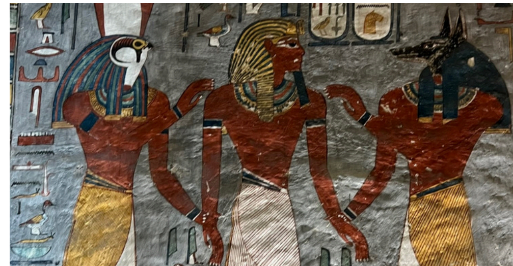
Valley of the Kings