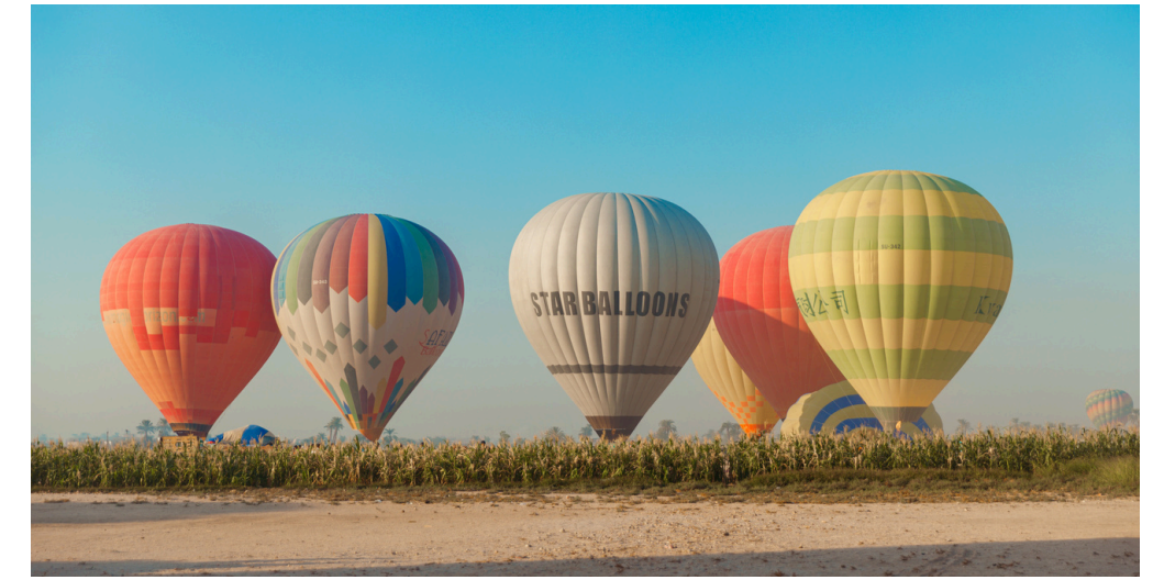
Hot Air Balloon