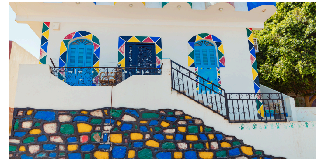
1 night at the nubian village