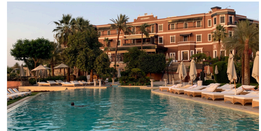
5 stars hotels